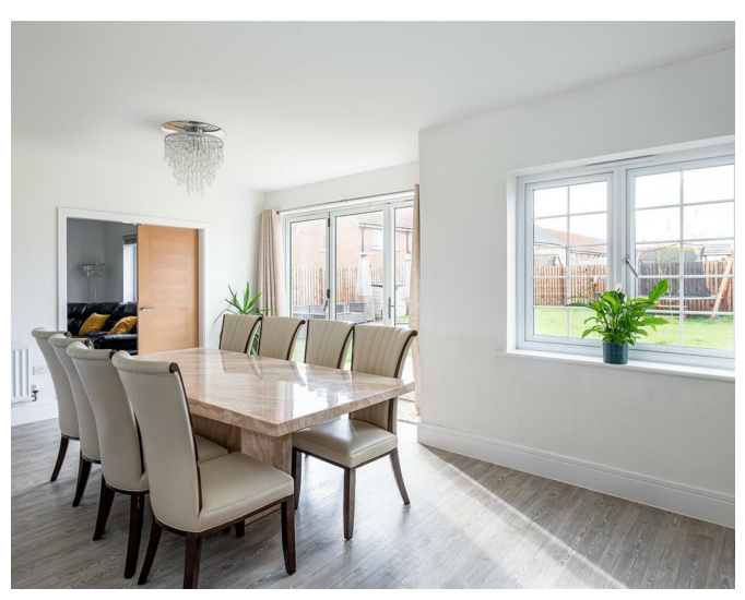
A stunning FAMILY SIZED executive home, complimented by stunning interior, GENEROUS SIZED LAWNED GARDENS and double garaging.

Accommodation comprises: storm porch, impressive sized entrance hallway with galleried landing over, large cloaks, under stairs storage. The layout flows seamlessly with each principal reception room accessed from the hall; including a living room that extends the full property depth. The hub of the property is a stunning 'L' shaped 'open plan' fitted kitchen diner/family room offering excellent sociable space. The kitchen is fitted with granite tops and incorporates a double integral oven/grill and microwave, gas hob with extractor over, tall standing fridge freezer and dishwasher. Karndean style flooring. Bi-fold doors provide garden views and access. Utility room with space for a washing machine and door beyond providing garage access.