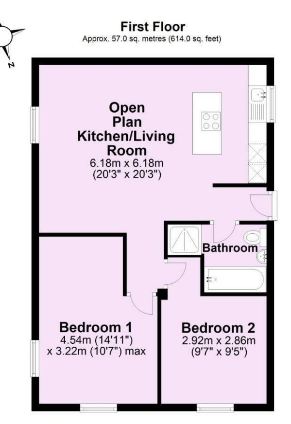
For Illustrative Purposes Only - not to scale Plan produced using PlanUp.

Length of Lease: 999 (years remaining: 956) Service Charge: £1300 (Review Period: Annual) Ground Rent: N/A