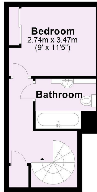
Ground Floor Approx. 23.1 sq. metres (248.3 sq. feet)