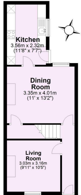
Ground Floor Approx. 38.1 sq. metres (410.0 sq. feet)