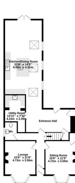
GROUND FLOOR 1333 sq.ft. (123.9 sq.m.) approx.